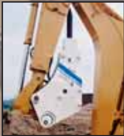
KF 6 SS

Switch Hitch mounting allows for greater "tuck" for loading, unloading and transport.