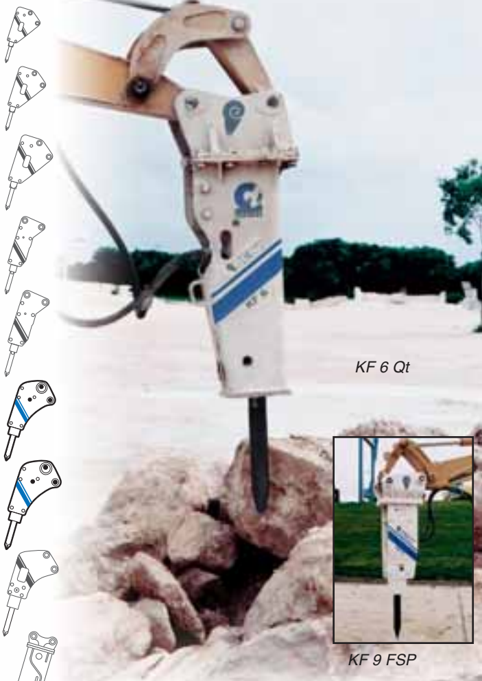
KF 6 Qt