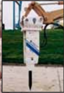
KF 9 FSP